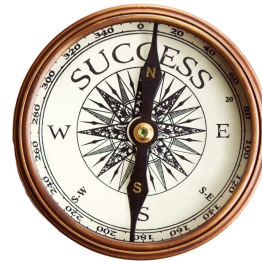
Chart a course to success with your referral sources

After patients, referral sources are the most important relationships for growing your practice.